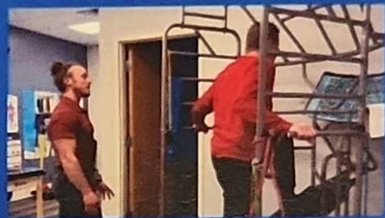
Personalized education to stay pain-free