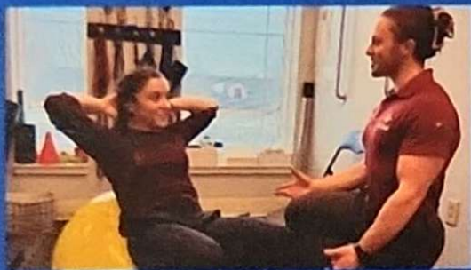
Strength, Stability & Flexibility Training

"To empower our patients to lead more active lifestyles with less pain through personalized therapy using advanced techniques and compassionate care."